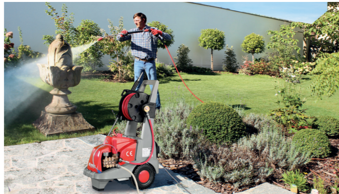
Rotating nozzle with stainless steel jet pipe (included in standard scope of delivery for KD523 Premium) Art-Nr.900181