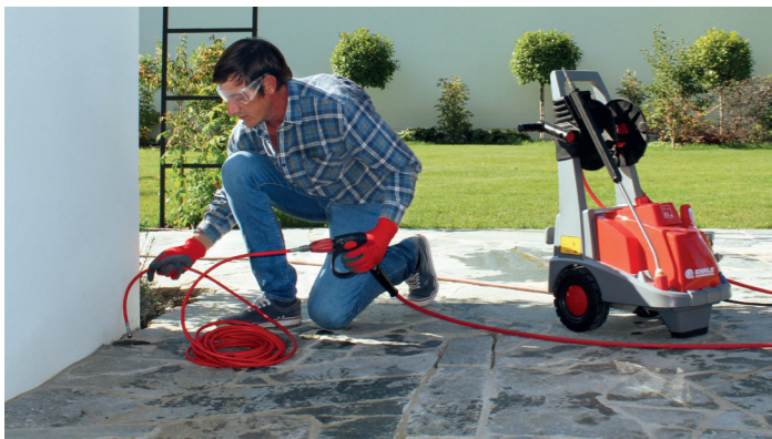
Pipe cleaning hose with spray jet and propulsion 15 m Art-Nr. 911119