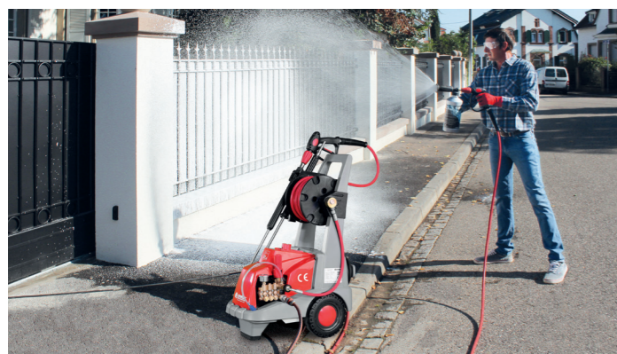
Foam lance with vario nozzle and 2 ltr chemical container Art-Nr. 410702