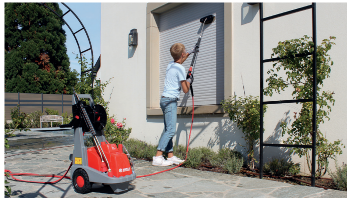
Surface washing brush for sensitive surfaces Washing width 300 mm, natural hair Art-Nr. 900155