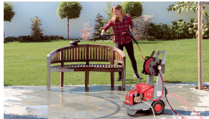
Rotating washing brush for difficult shapes 200 mm diameter, natural hair Art-Nr. 900156