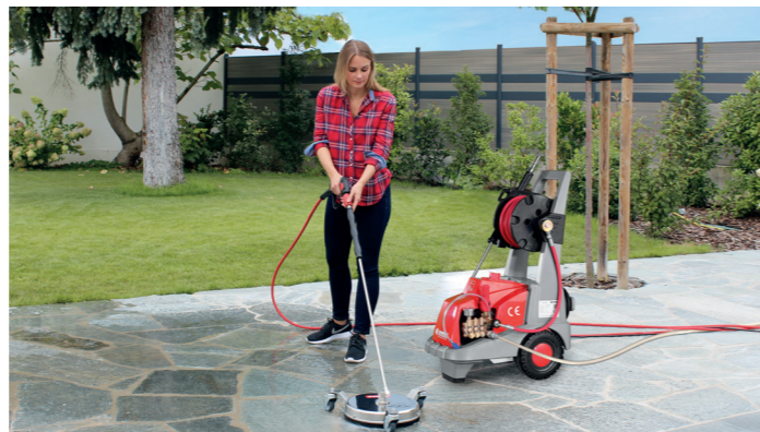
Floor surface cleaner made of stainless steel 300 mm diameter Art-Nr. 394078